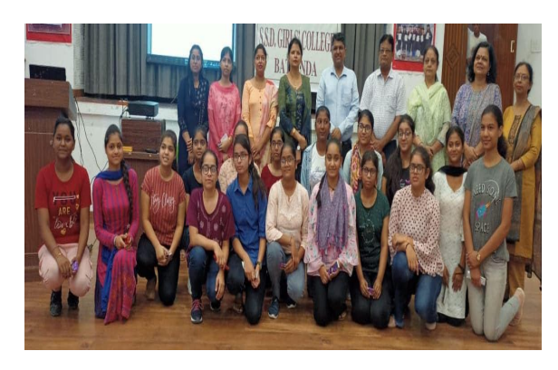
P.G. Department of Commerce of S.S.D. Girls' College, Bathinda organised one day workshop on GST on 6<sup>th</sup> Oct., 2021.